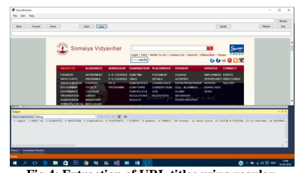
Fig 4: Extraction of URL titles using regular expression by voice command "Links"

Here to find all the URLs or URL titles, a global search or a complete search over the webpage source code needs to be done and accumulate the results. To do this a static method Regex.Matches() is used to match the strings found and to collect all the matches MatchCollection can be used which can be iterated and processed over.