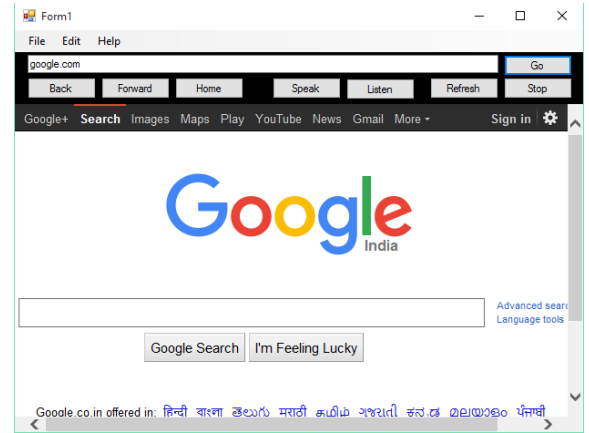
Fig 3: Opening of the web page on "Go" (speech command)

Problems related to the voice interface [4] [7]